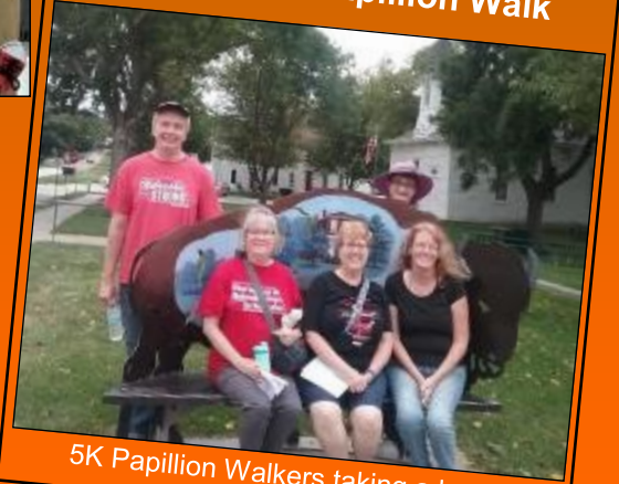
5K Papillion Walkers taking a break