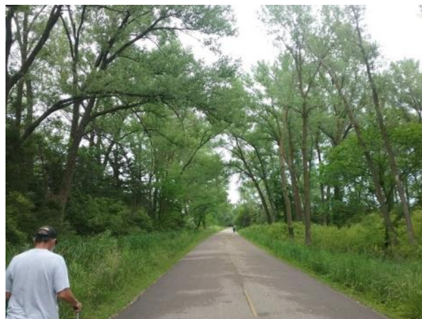
In addition to paved and grass trails, part of the walk is along park road.

If you visit the second week in June, you can attend the Lewis and Clark Festival which features movies about the expedition, buck skippers in frontier dress, bluegrass music and lots of living history (June 12-14, 2020). For a little more modern history, you can check out the lodge which was constructed in the 1930s by the Civilian Conservation Corps. For the nature lover, the walk through the woods offers abundant bird song and a possible encounter with local wildlife. The lake makes for some fine fishing. Modern campsites are available.