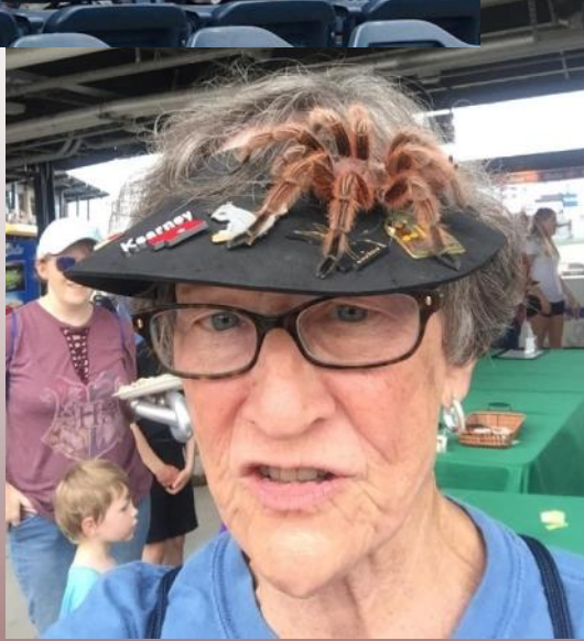
The Things you will meet at AVA outings!