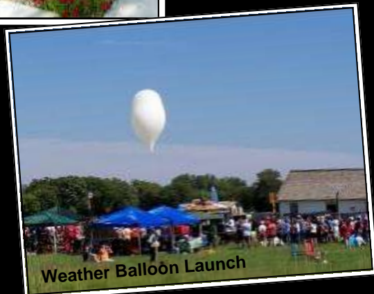
Weather Balloon Launch